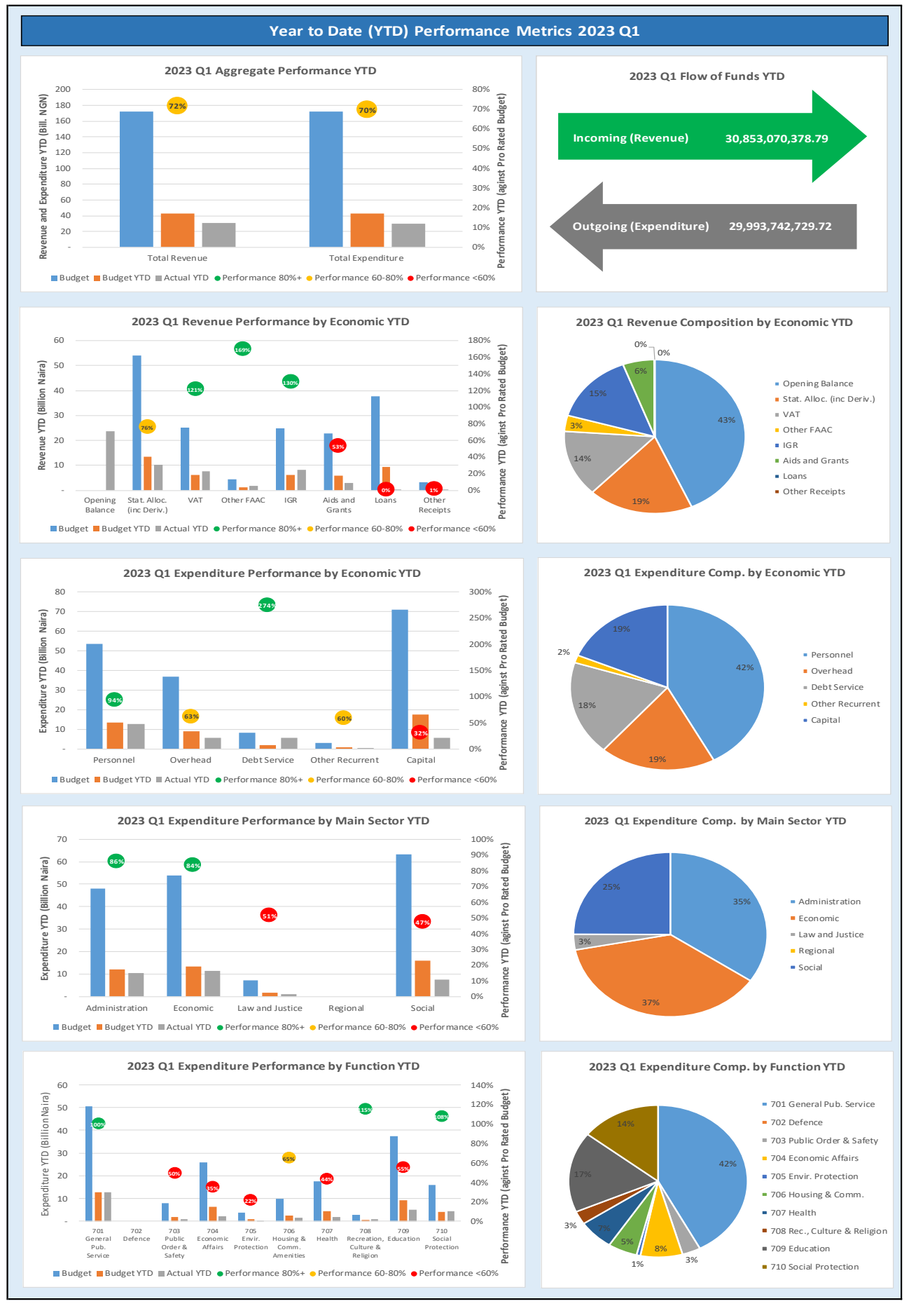
These graph above, conveys the Budget Performance for the first quarter of 2023 fiscal year.